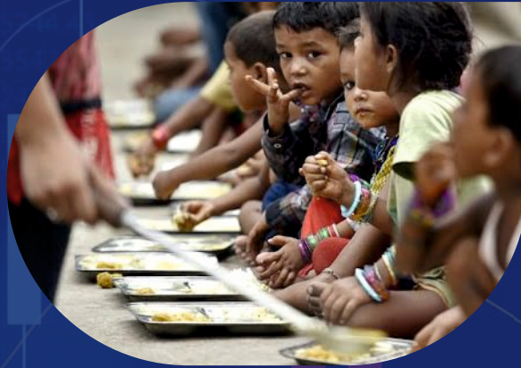
Foods for child